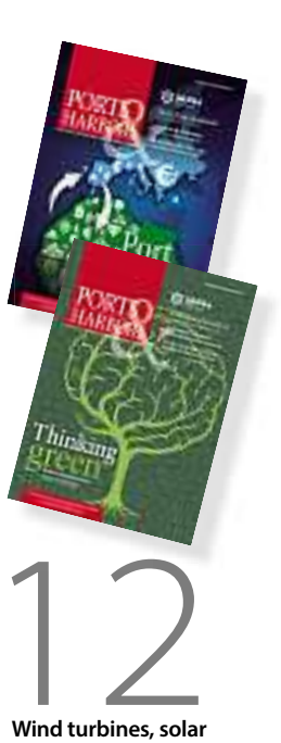
Wind turbines, solar panels, shore power, smart systems, and LNG fuel are just some of the ideas generated at the IAPH Sydney conference